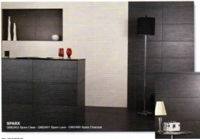
SPARX G662403 Sparx Clear - G662401 Sparx Lava - G662490 Sparx Charcoal